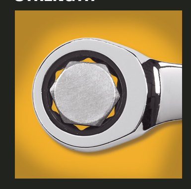
Surface Drive® provides a stronger grip on fasteners.