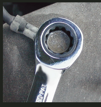
Stubby Combination allows access into tight areas that a standard wrench will not.